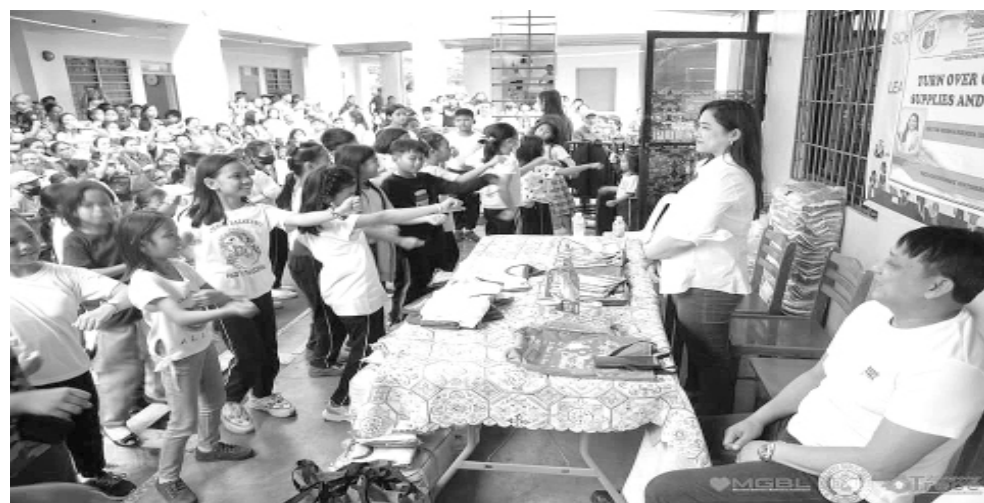
DISTRIBUTION OF SCHOOL SUPPLIES & P.E. UNIFORM 2023, TRECE MARTIRES CITY ON DEC. 20.