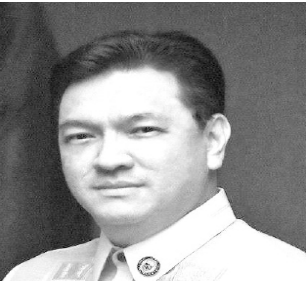
BACCOOR CITY Mayor Strike B. Revilla

Ang 2023 Seal of Good Local Governance na tinaggap ng Bacoor City ay pang 7 na sa loob ng 7 su-nod-sunod na taon simula pa noong panahon ni Sec. Jessie Robredo. "This re-markable achievement sets Bacoor City apart as the sole recipient of such recognition in the province of Cavite." Ayon mismo sa mga taga Bacoor ang 7th consecutive SGLG award ay isang tes-