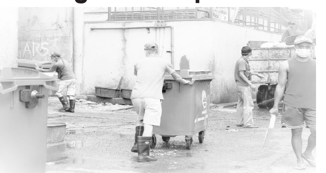
Mga bagong Garbage Bins na pinupwesto sa mga pamilihang publiko sa Imus City.

hindi lamang sa ating mga fice, CENRO, at City Inforpampublikong pamilihan, ngunit pati na sa kapaligiran ng ating lungsod."