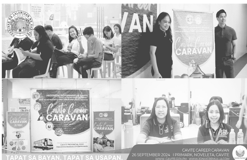
Final leg of the Cavite Career Caravan held in Noveleta on September 26, 2024.