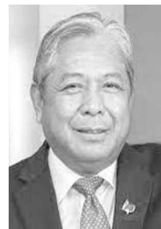
Transportation Sec. Jaime Bautista

ang project na ito bago mag Pasko para regalo natin sa mga taga-Bacoor (We hope this gets completed before Christmas as a gift to Bacoor