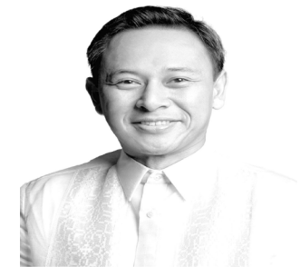
Education Secretary Sonny Angara

MANILA – The procurement of textbooks and learning tools will be faster for the fiscal year 2025, the Department of Education (DepEd) said Monday.