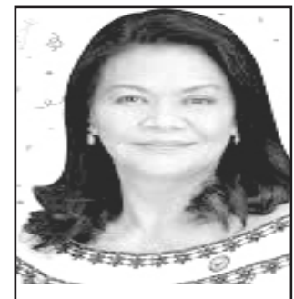
Rep. Dahlia Loyola

According to Mayor Dahlia Loyola, the evidence is said recognition of the city's anti-smoking campaign and their efforts to become a smoke-free city.