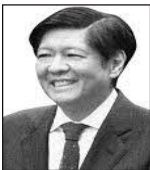
Pres. Ferdinand "Bongbong" R. Marcos, Jr.

The President made the remarks during the 6th