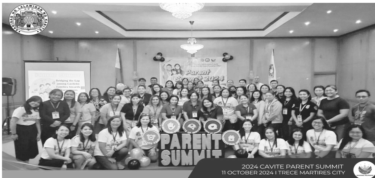
2024 CAVITE PARENT SUMMIT 11 OCTOBER 2024 | TRECE MARTIRES CITY