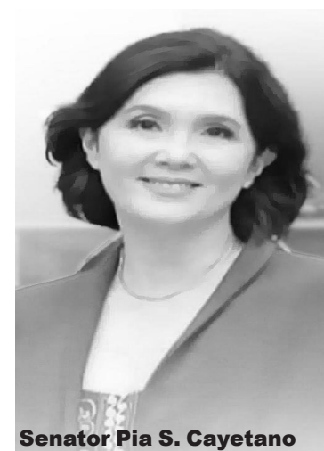
Senator Pia S. Cayetano