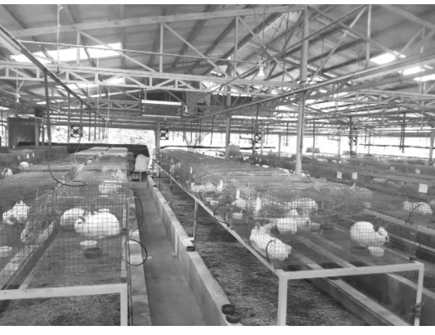
Lihim ng Kubli engaged in Rabbit production for 5 years