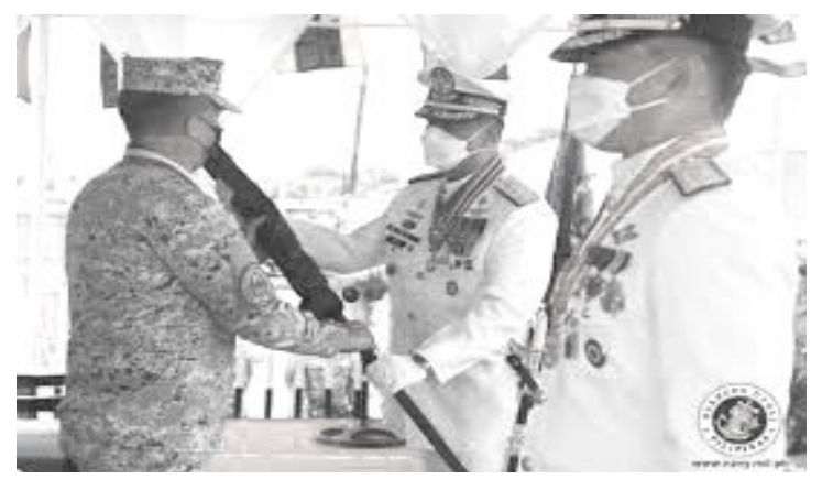
miral Carlos for an excellent job. "I have trust and complete confidence in your ability to manage the Western Command, as you have done here at PhilFleet. Good luck with your new and most challenging assignment yet," he added. Turn to page 5