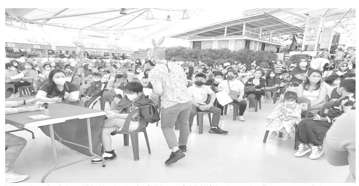
Inilunsad ang ResBakuna Kids: Vaccination for Children sa SKYRANCH sa lungsod ng Tagaytay noong Pebrero 9.