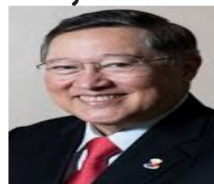
Finance Secretary Carlos Dominguez III

POGO service providers, meanwhile, are similarly required to submit proof that they have paid their 2019 in-