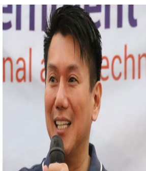
Mayor Emmanuel Maliksi

Meanwhile, employees of the DSWD and volunteers from other offices are working double time to finish the first batch of SAP cash subsidy distribution until May 10, 2020 amid continuous complaints regarding discrepancies on the validation of beneficiaries with the DSWD list.