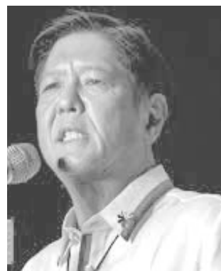
President-elect Ferdinand "Bongbong" Marcos Jr.