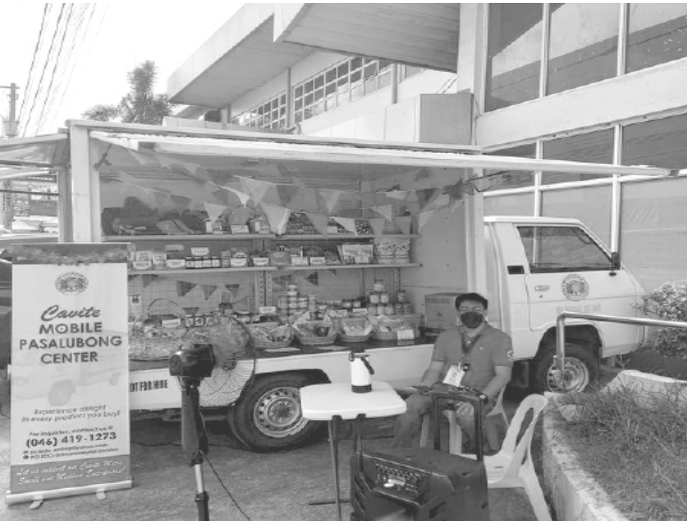
Our Cavite Mobile Pasalubong Center is present in PCLEDO's Business Opportunities for Cavite Cooperatives at Provincial Gymnasium, Trece Martires City. Bringing Cavite products closer