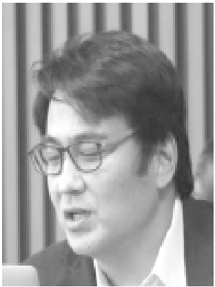
Sen. Bong Revilla, Jr.