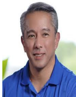
Governor Jonvic Remulla

He cited Article 694 of the New Civil Code or the provision about the abatement of nuisance.