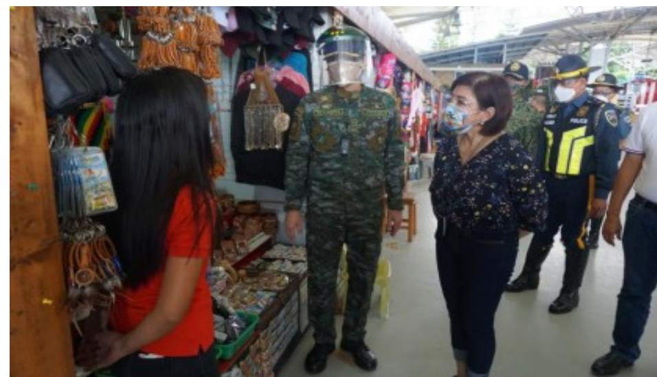
TAGAYTAY VISIT. Joint Task Force Covid Shield commander, Lt. Gen. Guillermo Eleazar (center), and Tagaytay City Mayor Agnes Tolentino visit a souvenir shop in the city on Saturday (Sept. 19, 2020). Police officials visited the city to inspect compliance of businesses and establishments with health and safety standards to prevent further transmission of Covid-19.