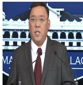
Presidential Spokesperson Harry Roque

"Sa New Civil Code po meron tayong proseso na tinawag na abatement of nuisance at si-yempre po kapag masyadong malakas ang mga karaoke, puwede maging nuisance po 'yan at ang abatement po talaga ay nasa kamay ng mga lokal na pamahalaan (In the New Civ-