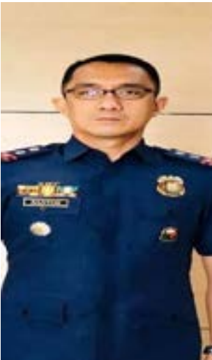
Provincial Director PCOL Marlon Santos

The Peace, Law Enforcement and Development Support (PLEDS) Cluster of the Cavite Provincial Task Force to End Local Communist Armed Conflict (TF-ELCAC) convened its first meeting last February 26, 2020 at Camp BGen. Pantaleon Garcia, Cavite Provincial Police Office in the City of Imus to formulate plans and programs that will promote peace, security and public safety in line with the vision of a safer Cavite.