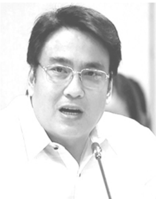
Senator Ramon Bong Revilla, Jr.