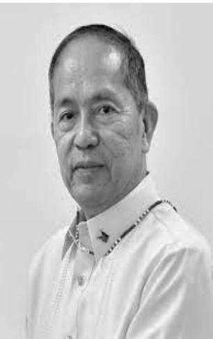
Labor Secretary Bienvenido E. Laguesma

Samantala, nagpulong din ang mga miyembro ng NCACL sa isang workshop upang tasahin ang PPACL Strategic Framework 2020-2022 at magbigay ng mga rekomendasyon