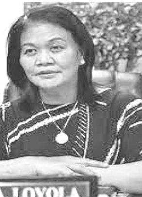
MAYOR DAHLIA LOYOLA

dustrial area traversing the South Luzon Expressway