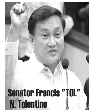
Senator Francis “TOL” N. Tolentino

Sen. Francis “Tol” Tolentino presides over the Committee on Justice and Human Rights’ public hearing on several bills creating Regional Trial Courts (RTC) in various provinces, cities and municipalities in the country on Wednesday, July 5, 2023. Tolentino enumerated some requirements of the Supreme Court in creating additional courts. “I have here several data coming from the Supreme Court. For an RTC, there should be at least 500 cases lodged within a sala of RTC. For first level court (Metropolitan Trial Court), there should be at least 300 cases.