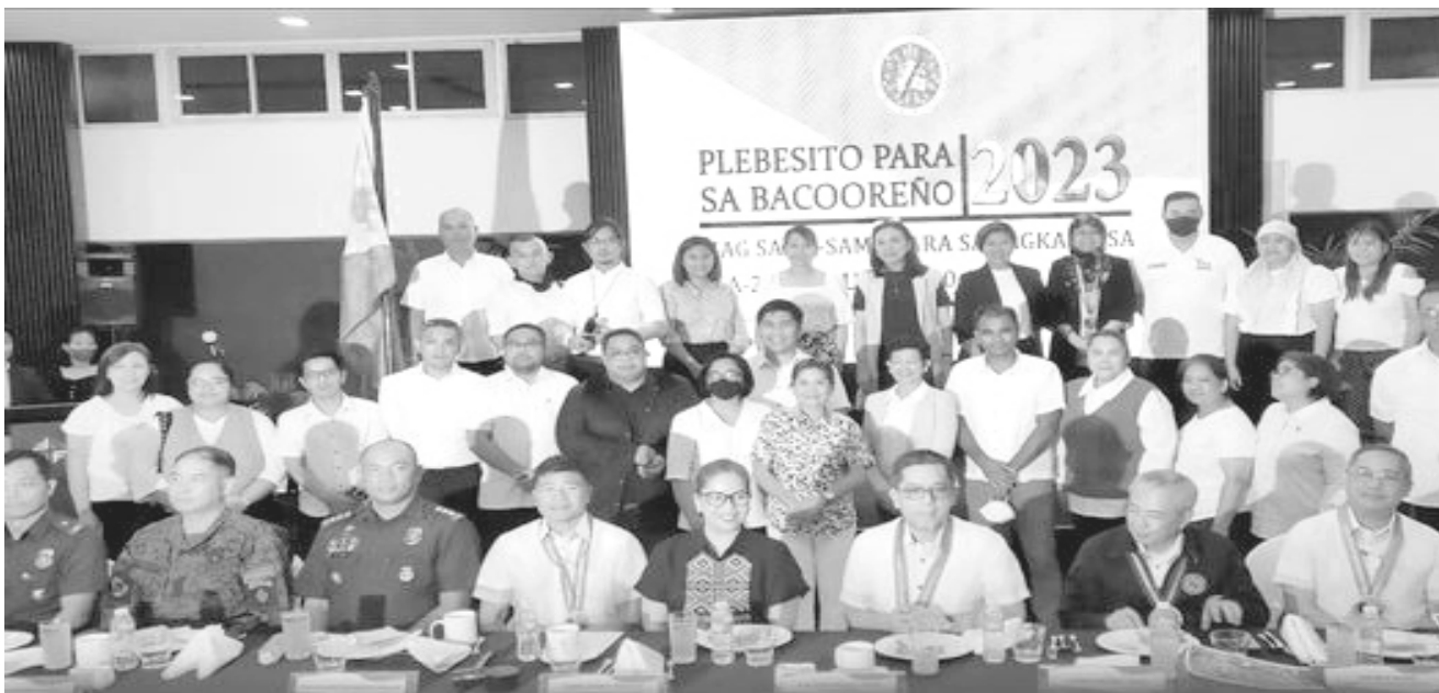
Officials, experts, government organizations, and representatives from political parties to address concerns and lay down preparations for the plebiscite last July 4 conference.

"Together, we must prioritize the safety of our citizens, protect their rights, and ensure a peaceful and successful plebiscite," he added. (Ruel B. Francisco, PIA-Cavite with reports from the City Government of Bacoor)