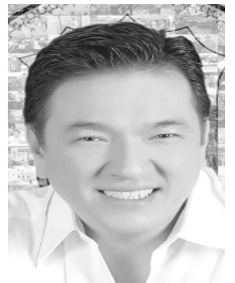
Bacoor City Mayor Strike Revilla

During the conference, the Police Regional