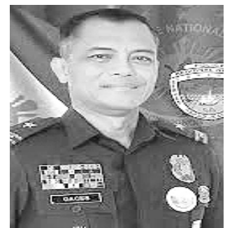
BGen Carlito Gaces, Calabarzon Police Director

Office in Calabarzon provided briefings on safety and security and updates on assessment and threat situations in Bacoor including security preparations for the upcoming plebiscite.