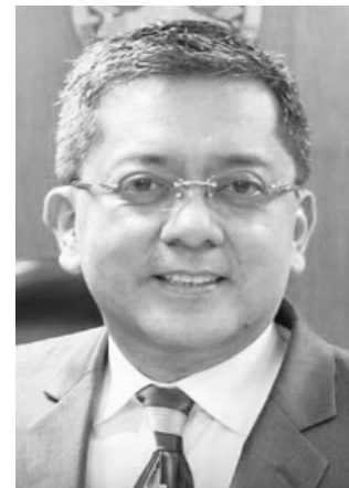
COMELEC Chairman George Erwin Garcia

TRECE MARTIRES CITY, Cavite (PIA) – The Bacoor City government and the Commission on Elections gathered key stakeholders in a joint security command conference ahead of the July 29, 2023 plebiscite that seeks to merge and reduce the number of Bacoor City's barangays.