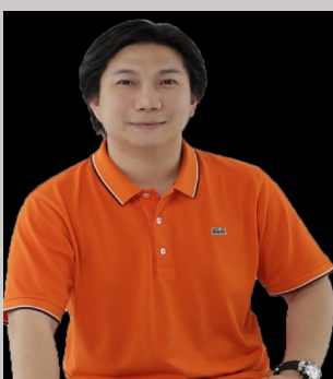
Noveleta Mayor Dino Reyes Chua