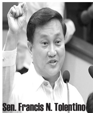
Sen. Francis N. Tolentino

"Ang kanilang pighati, kabiguan, maliliit na tagumpay... ay bahagi rin ng watawat ng Pilipinas na dapat ipagbunyi ng ating lahi," said Tolentino in his speech at the Shrine of the