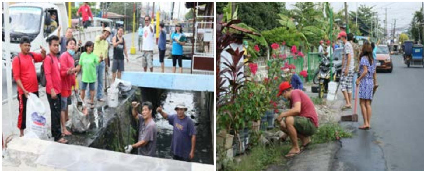
Clean up drive -February 1, 2020 at various barangays of Imus.