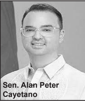
Sen. Alan Peter Cayetano