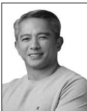
DILG Secretary JONVIC REMULLA

"As of last month, wala ng kuryente ang mga buildings dito. Pinatay na. Wala ng signs of habitation