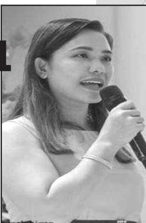
TMC Mayor Gemma Buendia Lubigan