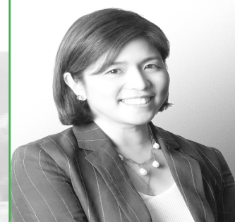
DBM Secretary Amenah F. Pangamdaman

"Among the priorities of the administration of President Ferdinand R. Marcos Jr. is to not just fully enforce the law when it comes to illegal drug use and abuse but also on rehabilitation of victims or drug users," Secretary Pangandaman said.