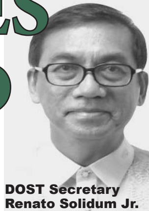
DOST Secretary Renato Solidum Jr.

MANILA – The government launched on Monday an integrated website containing disaster-related information.