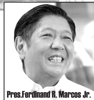
Pres.Ferdinand R. Marcos Jr.