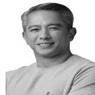
CAVITE GOVERNOR JONVIC REMULLA

Governor Jonvic Remulla emphasized the importance of working hand in hand with local leaders and constituents to create sustainable solutions for