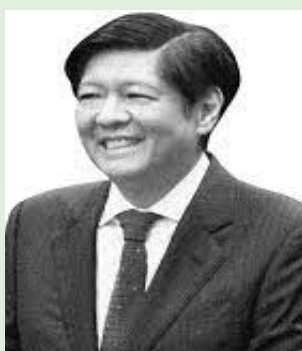
Pres. Ferdinand "Bongbong" R. Marcos, Jr.

During the distribution event at the Quiri-