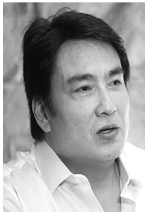
Sen. Ramon Bong Revilla Jr

It is only fitting that we focus on the needs of our teachers, because focusing enough attention on their well-being also means high esteem for the young people they shape and the future we look forward to," Revilla said in mixed Filipino and English.