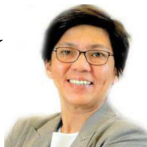
DOH Officer-in-Charge, Dr. Maria Rosario Singh-Vergeire

Formal nang pinasinayaan ng Department of Health (DOH) ang Building 5 ng Southern Tagalog Regional Hospital (STRH) noong Martes, Enero 17.