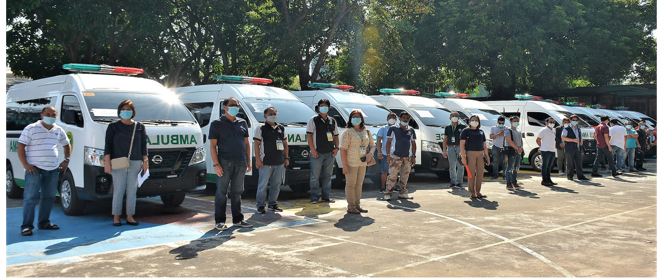
The 10 brand new land ambulances distributed to health facilities in the region presented during the turn-cver ceremony held at the DOH-CALABARZON regional office, Quirino Memorial Medical Center Compound, Project 4, Quezon City July 1, 2020. (Photo & caption: