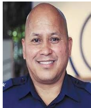
Senator Dela Rosa

"Ako naman, fair and square lang. Kung pabayaang nila yan, okay lang kasi kung halimbawa nag express ng dissent against government yang mga NPA na yan, yung mga terorista