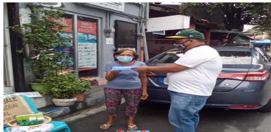
Barangay Panapaan 7

Today Oct. 5, Vice Governor Jolo Revilla shared 1,000 heavy duty face shields and 10,000 standard face shields in Bacoor City. The 73 Barangay Captains are happy, distributed additional protection to the citizens of such City. According to the vice governor, this is one of his ways to help in