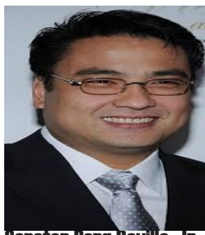
Senator Bong Revilla, Jr.

KAWIT, Cavite, (PIA) -- The Municipal Government here led by Mayor Angelo Aguinaldo recently entered into a partnership with Global Electric Transport (GET) Philippines to launch a modern public