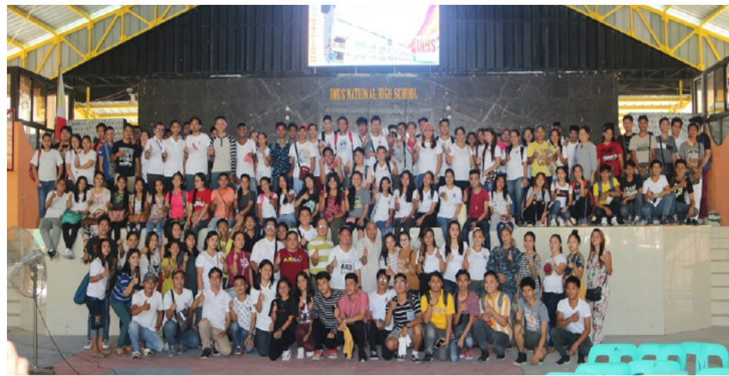
Youth Cooperative Orientation and Organization with City of Imus Cooperative, Livelihood and Entrepreneurial, and Enterprise Development Office (CICLEDO) and DepEd Imus held on July 13, 2019 at Imus National High School Main.