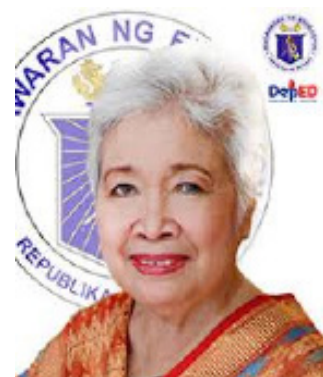
Education Sec. Leonor Magtolis Briones

DepEd and TESDA are creating a JWG on technical-vocational education and training (TVET), comprising five members from each agency, who will be primarily in charge of recommending policies, decisions, or activities for the harmonization and