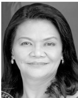
Mayor Dahlia Loyola

In an exclusive interview with the Philippine Information Agency CALABARZON, Mayor Dahlia Loyola revealed the city's