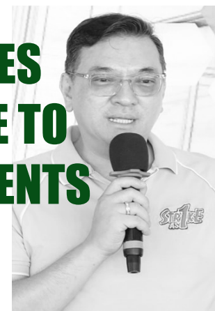
BACOOR CITY Mayor Strike B. Revilla

The initiative underscores the City Government's commitment to investing in the education of young Bacooreños, recognizing that education is