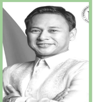
Education Secretary Sonny Angara