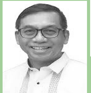
and DOST Secretary Renato Solidum Jr.

ship, the DOST will deploy scientists and researchers to "directly engage" with schools to act as resource persons. Turn to page4