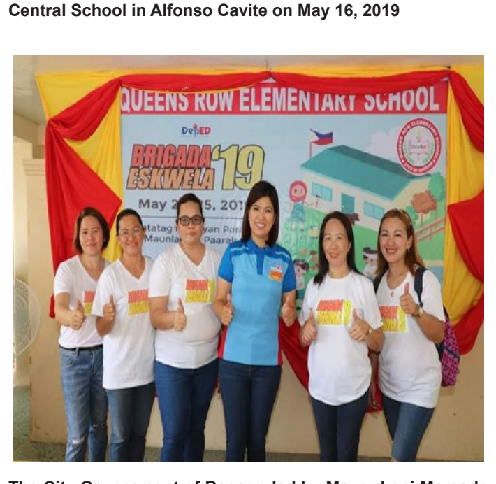
The City Government of Bacoor, led by Mayor Lani Mercado Revilla, joins Brigada Eskwela 2019. An annual program of the Department of Education, Brigada Eskwela aims to promote community participation in preparing school facilities for the opening of classes. In these photos, Mayor Lani lends her hand at Queens Row Elementary School.