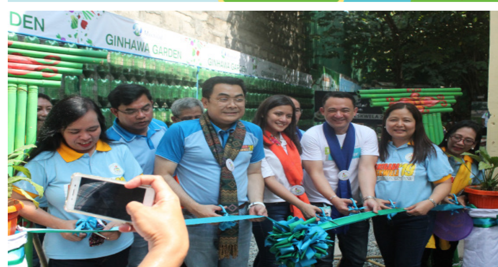
The Department of Education-National Capital Region (DepEd-NCR) formally kicked off this year's Brigada Eskwela at Las Piñas Elementary School Central (LPESC)