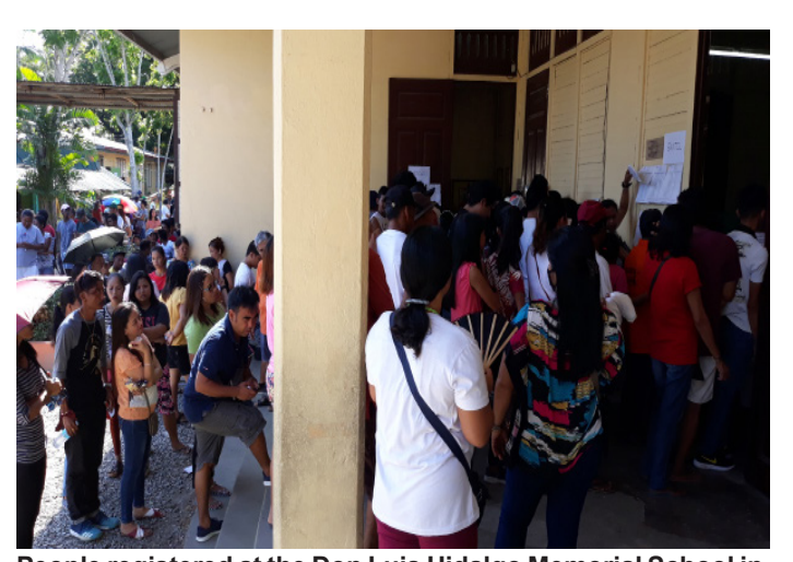
People registered at the Don Luis Hidalgo Memorial School in Boac, Marinduque await for their turn to cast votes during the Maya 13 National and Local Elections.