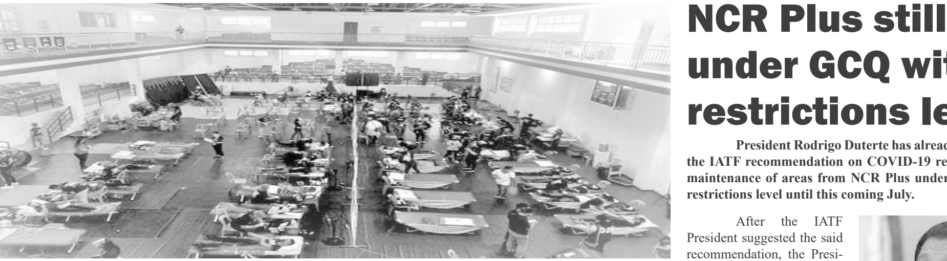
The last leg of the blood donation drive led by DOH-CALABARZON Regional Voluntary Services Program held at the Tangulan Arena in Kawit, Cavite on June 25, 2021. A total of 1,416 blood bags were collected