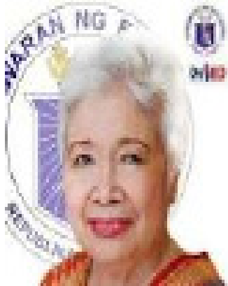
DepEd Secretary Leonor Magtolis Briones

Briones dropped in on classes to greet Grade 8 and 12 learners on their first day of class. When asked about their expectation for the new school year, a Grade 8 student said she is excited about lessons that would allow her to be aware of the current situation of the country. Briones advised the students to "think out of the box" and to discern facts and data: "You can grow your own conclusions. Huwag kayong magpapa-shape ng opinions ninyo, ng pag-analyze ninyo." In another class, Briones asked the Grade 12 learners on their plan about