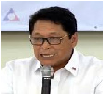
DOLE Secretary Silvestre Bello III

Some 70,000 local and overseas jobs will be offered during the nationwide job and business opportunities fair on June 12, the 121st anniversary of the Proclamation of Philippine Independence.