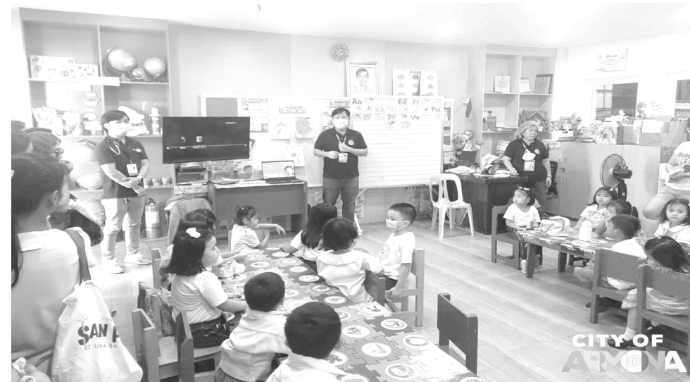
Pertussis campaign sa Herminia L. Zamora Child Development Center, Carmona City.

Kung ikaw ay may sintomas ng pertussis, magpakonsulta lamang sa pinakamalapit na Barangay Health Center o kaya naman ay dumulog sa City Health Office. Stay safe and healthy, City of Carmona!