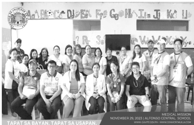
TAPAT SA BAYAN. TAPAT SA USAPAN.