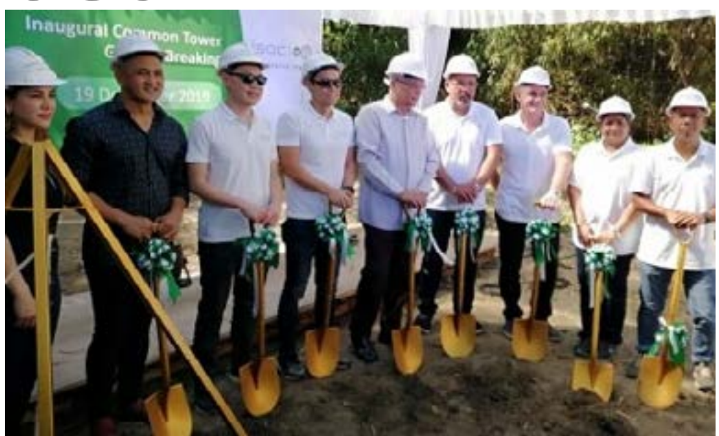
COMMON TOWER. Department of Information and Communications Technology (DICT) Undersecretary Elizeo Rio (leftmost), with edotco and ISOC infrastructure officials, led the groundbreaking rites for the construction of the first common tower in Addas Greenfield Village, Bacoor City, Cavite on Thursday (Dec. 19, 2019). The infrastructure aims to reduce the country's subscriber-to-tower ratio which currently stands at over 7,000 subscribers per tower.

The common tower, which is expected to rise within the next few months, hopes to host not just one but three of the country's major telecommunication operators.