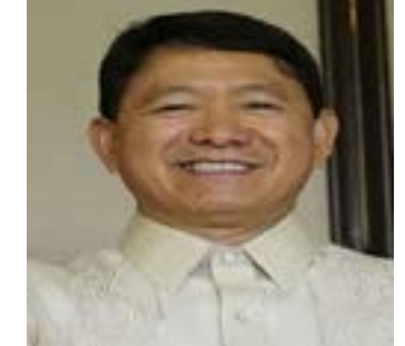
DILG Secretary Eduardo M. Año

The Department of the Interior & Local Government (DILG) ordered the Local Government Units (LGUs), the Philippine National Police (PNP) and the Bureau of fire Protection (BFP) to strictly enforce firecracker laws embodied in Memorandum Circular 2017-105, implementing EO 28 which enjoins the LGUs, the PNP, and the BFP to take necessary actions on the regulation and control of the use of firecrackers and other pyrotechnic devices nationwide. Turn topage5