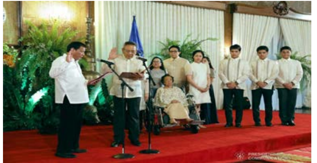
President Rodrigo Roa Duterte administers the oath to newly appointed Supreme Court Chief Justice Diosdado Peralta during a ceremony at the Malacañan Palace last October 24, 2019.