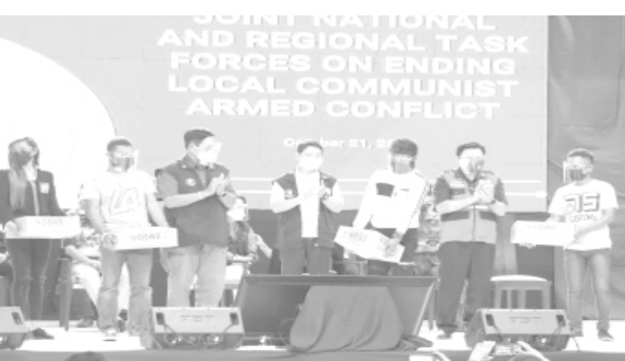
The National Task Force and Regional Task Forces on Ending Local Communist Armed Conflict (NTF-RTF ELCAC) brought various government programs and services to Quezon province in a series of turnover of projects, programs, and activities to beneficiaries today, October 21.

binabayaran ng bawat isa, nagtutulong tulong po kami para sa new normal na edu-