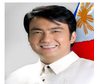
Sen. Ramon Bong Revilla, Jr.