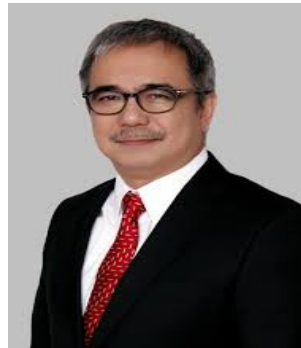
Secretary Fortunato dela Peña

Earlier in a virtual presser, dela Peña reiterated that RapidPass is the DOST's contribution to help the Philippine National Police lessen contacts at the checkpoints.