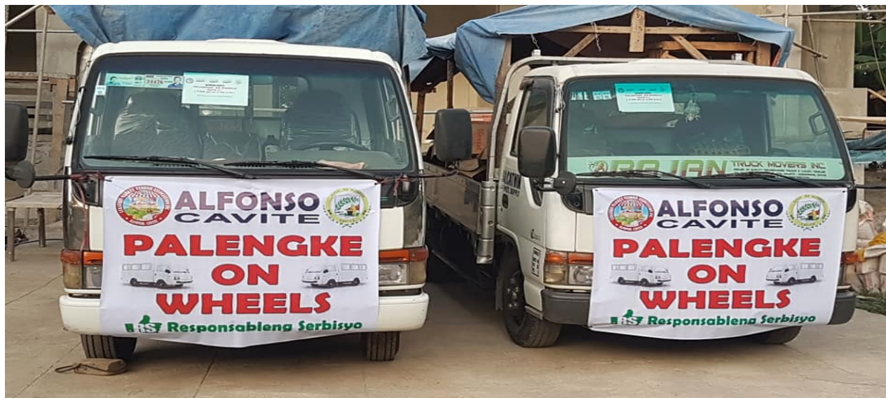
Palengke on Wheels will continue to provide Alfoseños safe access to food under the SSE-ECQ effective May 3 - 15, 2020.