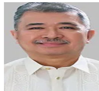
Secretary Fortunato dela Peña

MANILA – The Department of Science and Technology (DOST) has approved the clinical trials for the local herb, lagundi, against the coronavirus disease 2019 (Covid-19), Secretary Fortunato dela Peña said.