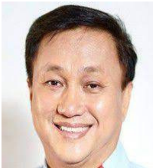
Sen. Francis Tolentino

Tolentino welcomes pilot implementation of face-to-face classes in low-risk areas