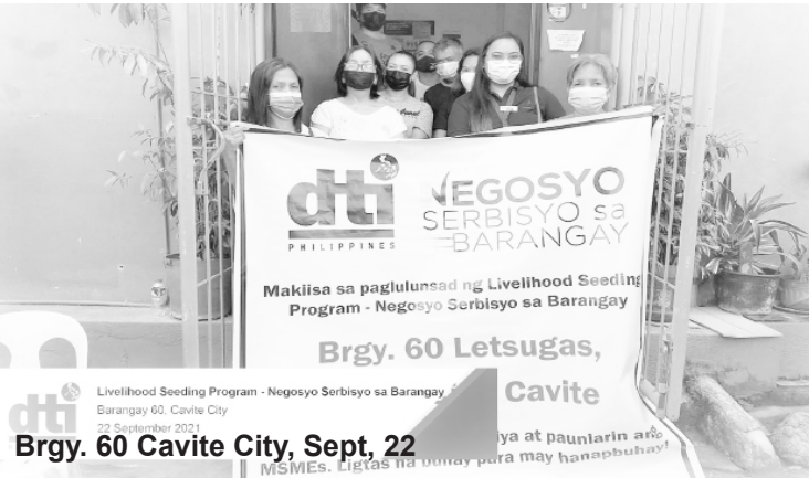
Brgy. 60 Cavite City, Sept. 22

Bago matapos ang taon, limampung benepisyaro mula Cavite City nakatakdang tumanggap ng Livelihood Starter Kits sa ilalim pa rin ng programa.