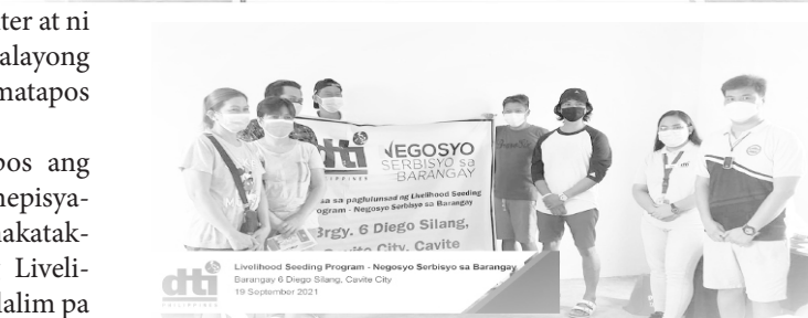
Brgy. 6 Diego Silang, Cavite City, Sept. 19

NAIC - Patuloy ang pagsasagawa ng antigen swab testing sa mga empleyado ng lokal na pamahalaan upang matiyak ang kaligtasan ng mga kawani ng gobyerno, maging ang publiko na nagsasagawa ng transaksyon sa munisipyo noong Sept 21.