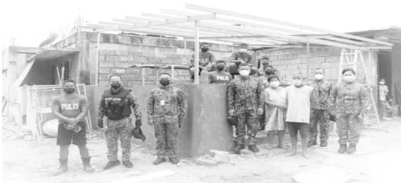
PNP Community Relations Activities: “Project Silong” Project of RMFB 4A in Batangas City.

Meanwhile, RD Cruz encouraged the continuous collaboration between the PNP and other government agencies as well as the engagement with the different sectors of the society in the conduct of various Police Community Relations initiatives in the region that will pave the way for credible, sustainable, and compelling grassroots strategies in support to the objectives of the Regional Task Force to End the Local Communist Armed Conflict (RTF-ELCAC). (PIO-4A)