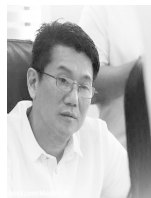
Mayor Manny Maliksi