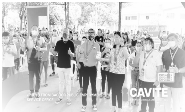
160 displaced received financial assistance from DOLE program, Tulong Panghanapbuhay Disadvantaged/Displaced Workers (TUPAD) last Sept. 22 in Bacoor City

Kasabay nito, patuloy ang pagbabakuna ng mga lokal na pamahalaan dahil upang umabot na sa 1.8-milyong dose ng bakuna kontra Covid-19 ang naimamahagi sa buong lalawigan.