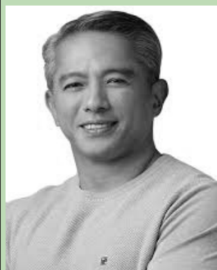
CAVITE GOVERNOR JONVIC REMULLA