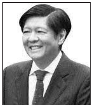
Pres. Ferdinand "Bongbong" R. Marcos, Jr.