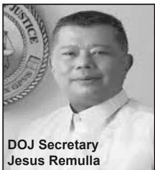
DOJ Secretary Jesus Remulla