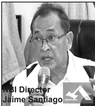
NBI Director Jaime Santiago

awags in the country's premier law enforcement office.