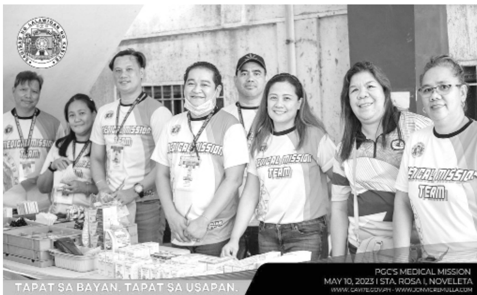
A medical mission supervised by the team from the Office of the Provincial Governor was held in Barangay Sta Rosa I, Noveleta Cavite on May 10, 2023, providing free medical services to residents.

The medical mission was able to serve 239 patients, providing free consultation and medicines. It was well-organized and showcased the dedication of healthcare professionals from the Provincial Health Office with the assistance of Sta. Rosa I Barangay officials and volunteers.