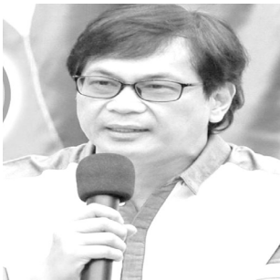
Interior Secretary Benhur Abalos

During the BIDA Fun Run held here on Jan.