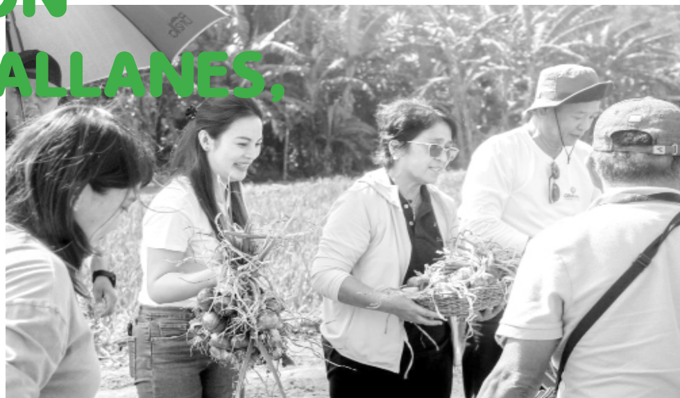
Onion Harvest Festival kasama si Magallanes Mayor at Office of the Municipal agriculturist noong nakaraang Enero 18, 2024