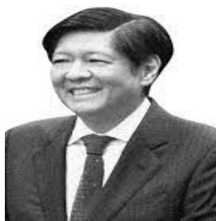
Pres. Ferdinand "Bongbong" R. Marcos, Jr.

The Land Transportation and Franchising Regulatory Board (LTFRB) said public utility vehicles totalling 190,000 units, comprising of UV Express, PUJs, mini-buses and buses,