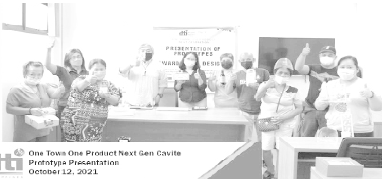
dti One Town One Product Next Gen Cavite Prototype Presentation October 12, 2021

OTOP NG 2021 Cavite conducted its Prototype Presentation at the DTI Cavite Provincial Office last October 11 and 12, 2021.