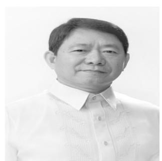
DILG Secretary Eduardo M. Año

Section 4 of Republic Act 10168 known as 'The Terrorism Financing Prevention and Suppression Act of 2012' states that any person who finances terrorist groups to carry out or facilitate the commission of any terrorist act, by a terrorist organization, association or group, or by an individual terrorist, shall be guilty of