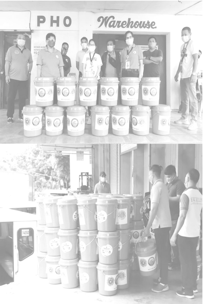
The Provincial Health Office of Cavite receives its allocation of maternity kits or mama kits from DOH-CALABARZON recently.

“Kasama na dito ang efficient and effective referral systems para magkaroon ng access sa emergency obstetric and newborn care. That is why we have been providing adequate trainings for health care workers and improving health services at the primary care level to safeguard their health and welfare.” The maternity kits will be given to pregnant and expecting mothers in the communities through the barangay health units.