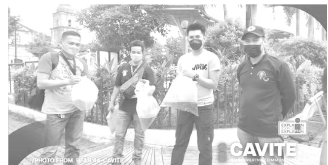
angan na inilalapit ng mga fish pond operator sa kanilang tanggapan.

According to Tolentino, it's about time to amend the present procurement rules; by doing so, the senator believes it will promote and sustain efficient and good governance.