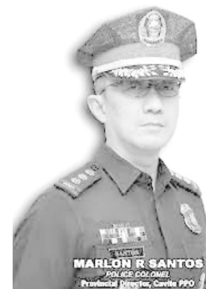
police operational activities and crime prevention programs.(Cavite PIO)

Cavite Police will continue to strengthen its efforts in all