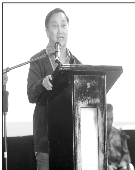
Senator Francis Tolentino