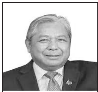
DOTr Secretary Jaime Bautista

MANILA – Department of Transportation (DOTr) Secretary Jaime Bautista assured Japanese Prime Minister Fumio Kishida that several Japanese-funded big-ticket transportation projects are “on track.”