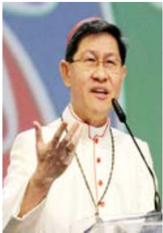
Cardinal Luis Antonio Tagle

"As we observe physical distancing, let us not forget the communal caring. That's what Jesus did, God with us," Tagle also said.