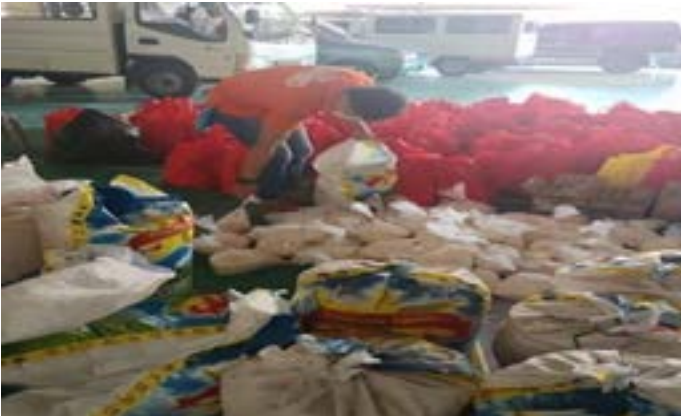
IMUS CITY GOVT:Patuloy ang repacking ng relief goods para sa ating mga kababayan at sinisikap natin itong matapos upang agarang maipamigay.