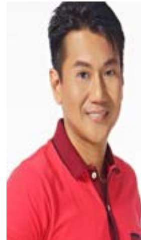
Mayor Emmanuel Maliksi

IMUS CITY, Cavite (PIA) --Imus City Mayor Emmanuel Maliksi together with officials of concerned offices outlined a program for transportation, food, health and other concerns to address issues that cropped up in the implementation of enhanced community quarantine (ECQ) in the city.