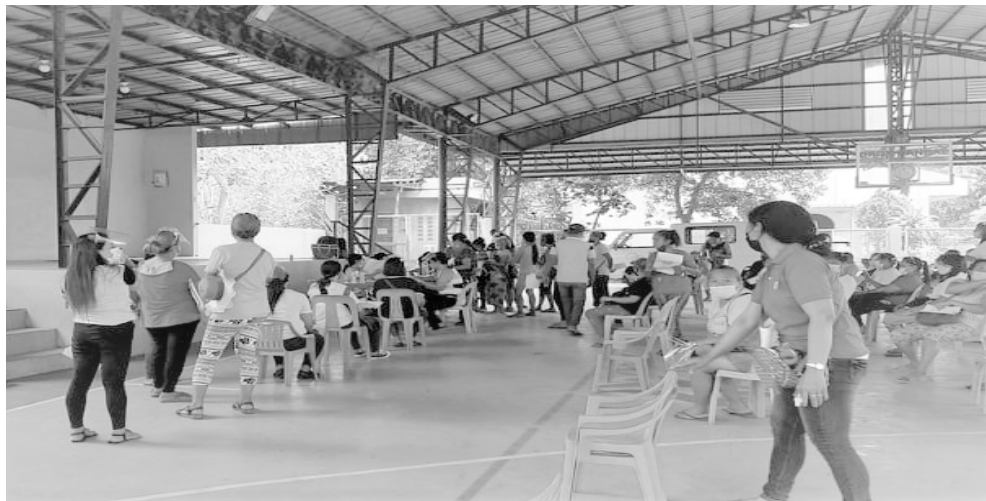
Ibat-ibang Barangay sa Carmona para sa Assistance sa low-income families upang makuha ang ayuda mula sa national government.