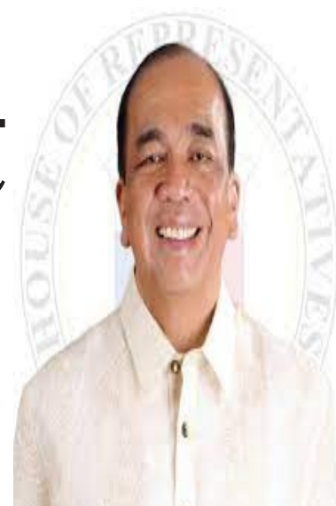
Rep. Elpidio Barzaga Jr.

A lawmaker on Tuesday called for a stronger information campaign to boost the people's confidence in the coronavirus disease (Covid-19) vaccination program by holding regular webinars to be aired live on government television channels and radio stations.