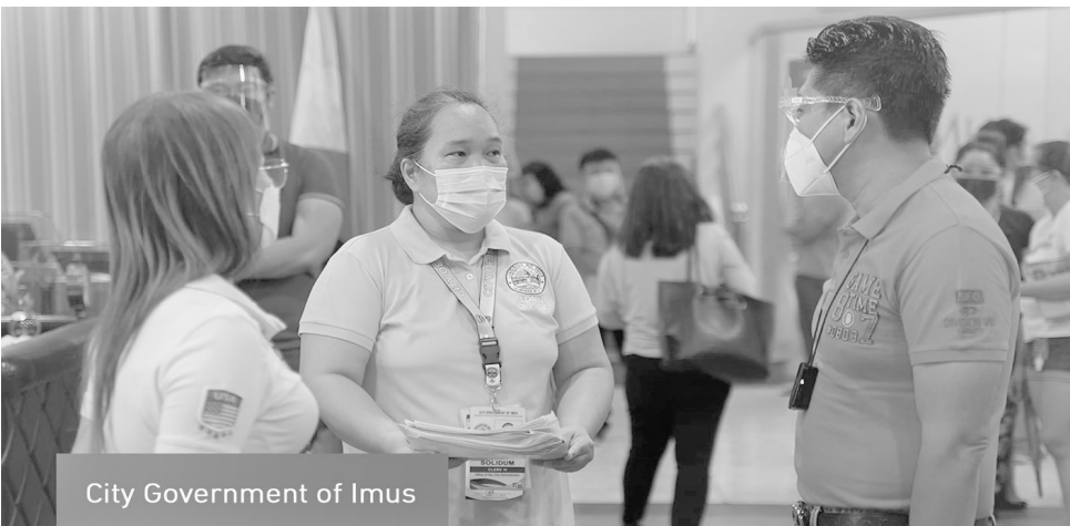
City Government of Imus After the city received the RITM-DOH accreditation for its pooled testing capability, the city government immediately conducted mass testing for city hall employees.

MUNICIPALITY OF CARMONA: Binisita po ng inyong lingkod ang ilan sa ating ongoing infrastructure projects. Kabilang na po rito ang Multipurpose Hall sa Barangay Maduya, future site ng BJMP Carmona, chapel, crematorium and columbarium. Ilan lamang po ang mga ito sa ating mga plano para sa mas ikauunlad ng ating bayan.