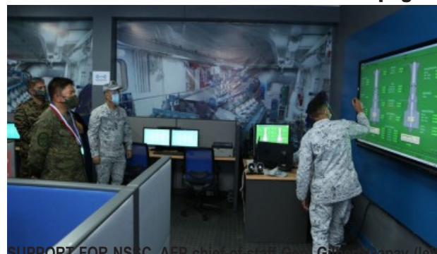
SUPPORT FOR NSSC. AFP chief-of-staff Gen. Gilbert Gapay (left) takes a tour of the Naval Sea Systems Command units in Cavite City on Wednesday (Nov. 4, 2020). During the tour, the NSSC showcased cutting-edge technologies in the fields of weaponry, electronic communications, virtual and augmented reality, virtual training, and education.