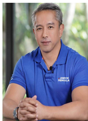
Cavite Governor Jonvic Remulla

TRECE MARTIRES CITY, Cavite hhhhhhhh(PIA) – The Provincial Government of Cavite once again declared the province under a “State of Calamity” after the onslaught of Tropical Storm “Ulysses” in the province on November 11.