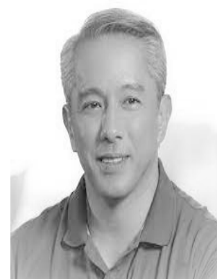
Gov. Jonvic Remulla

Samantala, nananatiling limitado ang operasyon ng mga restaurant, non-leisure retail, mga salon, at mga kapare-