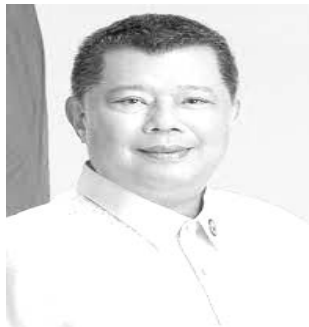
Cavite Rep. Jesus Crispin Remulla

"For the record, last year, the Senate raised the budget of the DILG family by more than P3 billion with