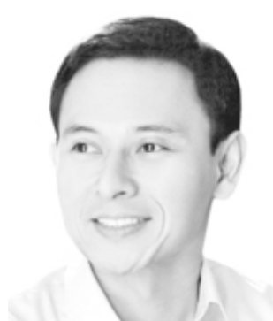
Senator Sonny Angara

standing of the department and all the other agencies, those will be our utmost priorities going into 2022. Yung health response po ng bansa, because that's our very existence under threat," Angara said.