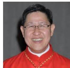
Cardinal Luis Antonio Tagle

According to the Catholic Bishops' Conference of the Philippines (CBCP) news website, Ta- Turn to page 3