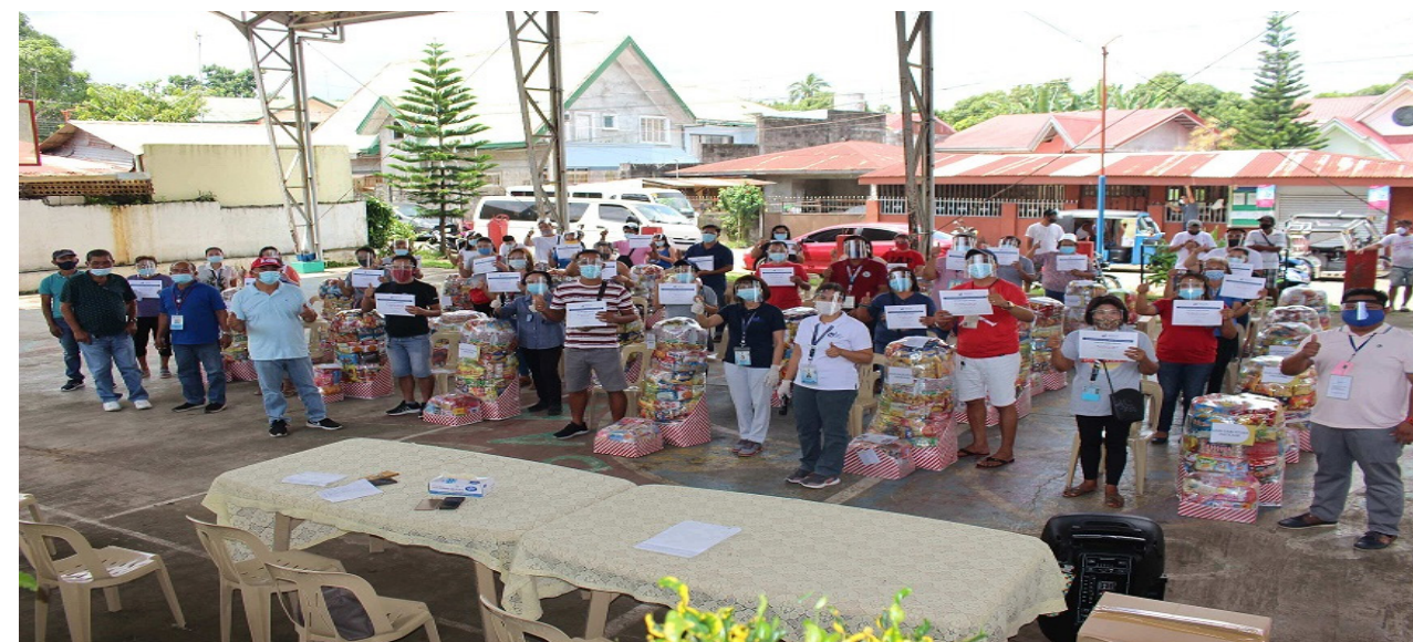
Among the recipients of the "Pangkabuhayan Packages from DTI 4-A were residents of Barangay Anuling Cerca 1 and 2, Anuling Lejos 1 and 2, and Palocpoc 1 and 2, Mendez, Cavite