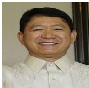
DILG Secretary Eduardo M. Año

"We welcome the signing of Bayanihan 2 Law for it means that we can now