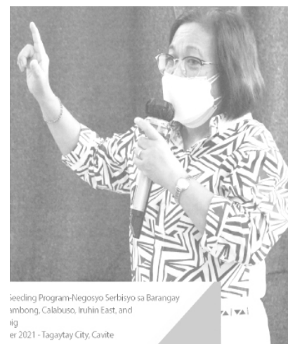
Seeding Program-Negosyo Serbisyo sa Barangay Sambong, Calabuso, Iruhin East, and Bagong Tubig December 2021 - Tagaytay City, Cavite

Last week, December 7, 2021, DTI Cavite launched the Livelihood Seeding Program - Negosyo Serbisyo sa Barangay in the ff. barangays in the Tagaytay City: