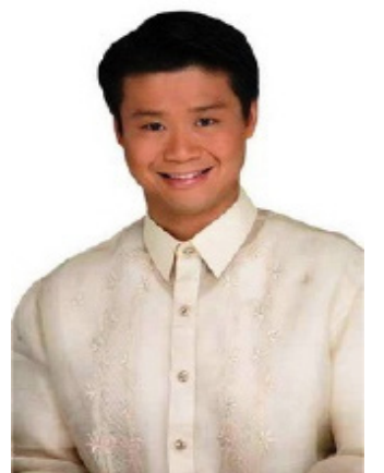
Senator Win Gatchalian

"The revival of the mandatory basic ROTC program will inculcate discipline in our