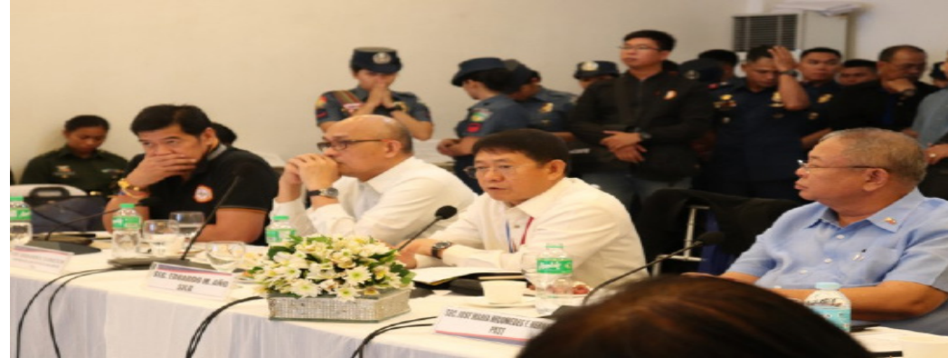
DILG Sec. Eduardo Año delivers his message during the RTF-ELCAC Meeting on May 17, 2019.

He said his job is to ensure that the RTF is aligned with the National Task Force (NTF) and to give advice in order to succeed in its endeavor