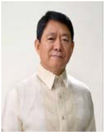
DILG Secretary Eduardo M. Año

“Sa panukalang batas na ito ay maipagpapatuloy natin ang kampanya laban sa salot ng droga sapamamagitan ng pagtatag ng mga ADACs sa tulong ng mga lokal na pamahalaan kahit tapos na ang termino ni Pangulong Duterte,”