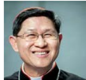
Caritas Intl president Cardinal Luis Antonio Tagle

"I hope this center will not only contribute to the Philip-