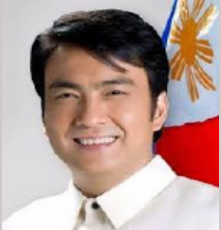
SEN. BONG REVILLA

The Committee on Public Information and Mass Media led by Sen. Bong Revilla, Jr. held its organizational meeting today, as Revilla expressed the readiness of the committee to tackle the anti-fake news bill.