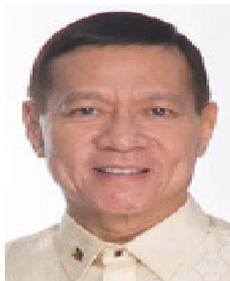
DOH Sec. Francisco Duque

Ang 5S ay kinabibilangan ng mga sumusunod: 1. Search and destroy- suyunin at sirain ang mga pinamumugaran ng lamok; 2. Self protection measures o pangangalaga sa sarili katulad ng pagsusuot